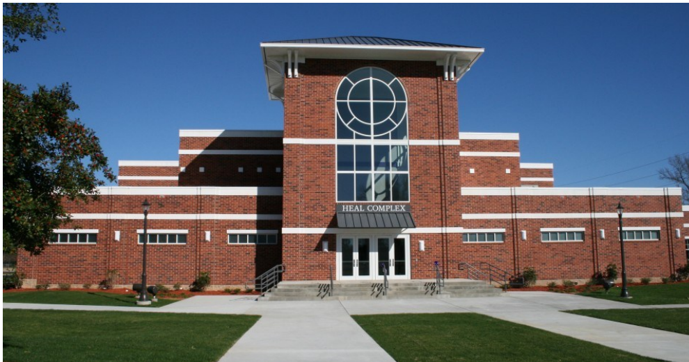
The Randall Carter Gymnasium Complex

The tenth annual meeting of the Georgia Psychological Society will be held in the on the campus of Paine College in Augusta, Georgia on April 4, 2015